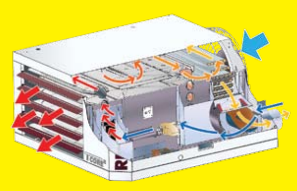
TCORE<sup>3™</sup> Heat Exchanger (patent pending)